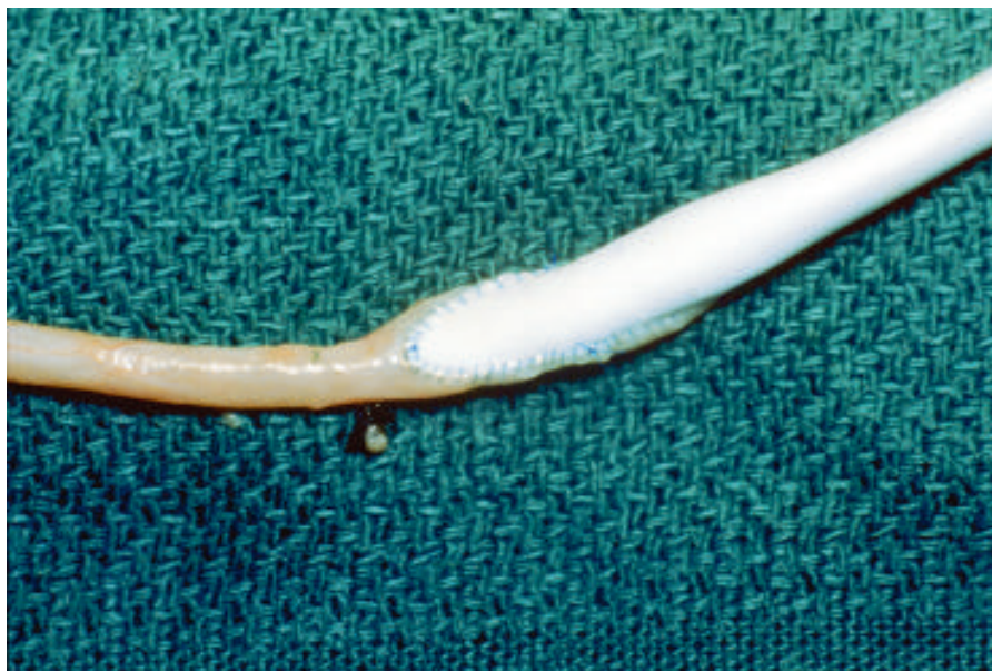
Figure 3. An ePTFE saphenous vein composite graft.