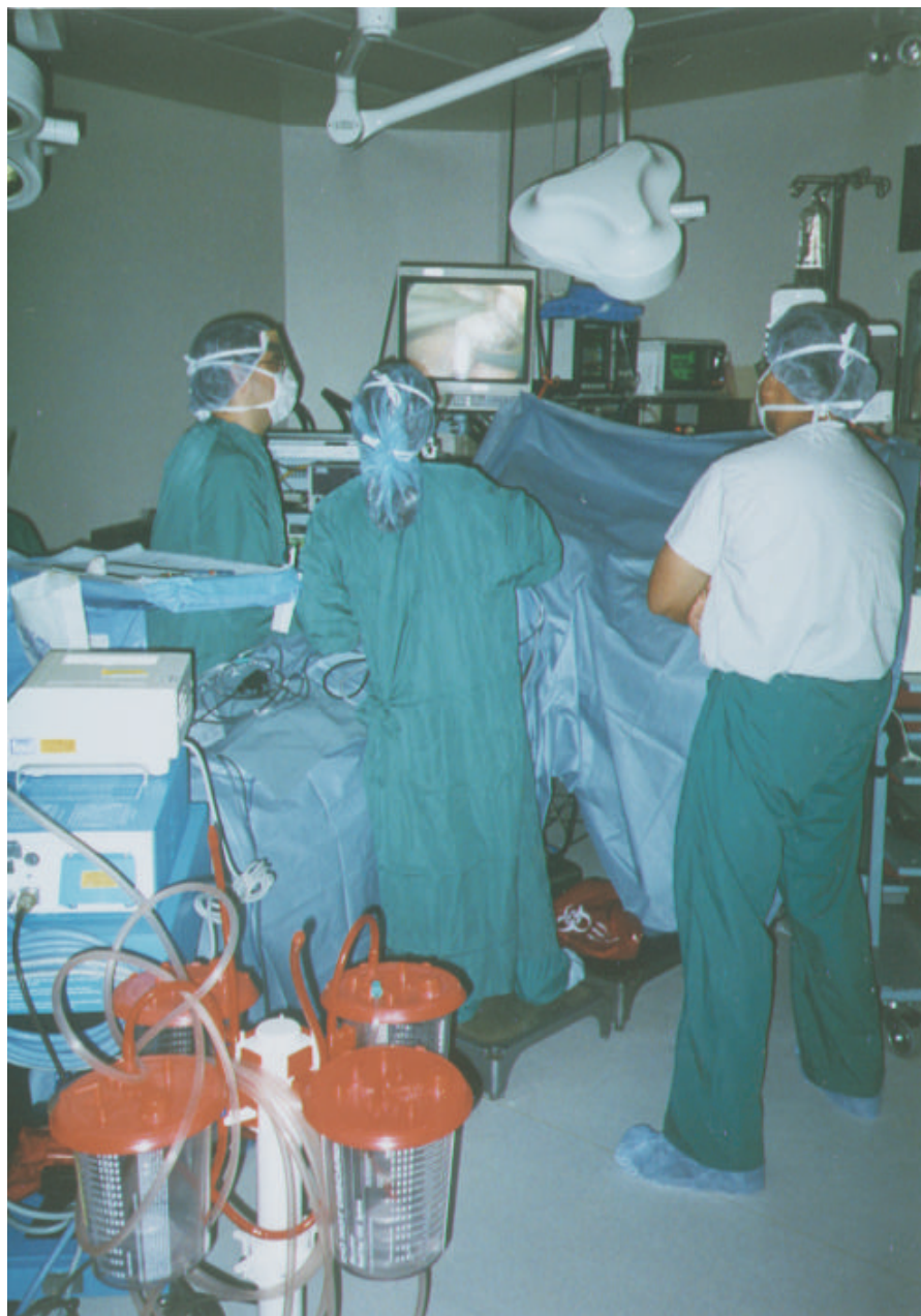
Figure 1. Intraoperative photograph of a laparoscopic operation demonstrating the accessory equipment needed for this type of surgery.

sources, insufflators, suction/irrigation devices, and other instruments needed to perform minimally invasive procedures—takes up additional space in an already crowded OR environment (Fig. 1). 2 Laparoscopic operations are also afflicted with an increased number of tubes and cables connecting the equipment to power and vacuum sources as well as to the operating field. The hazards of a multitude of cables in crowded ORs have been discussed by other authors. 3,4 Thus during laparoscopic surgery, surgeons and other members of the operating team find themselves working in an increasingly cramped space with a limited ability to arrange the OR layout to their needs. In summary, laparoscopic operations highlight the need to eliminate today's clutter of equipment and lines in future OR designs.